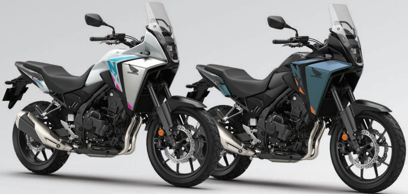
Pearl Horizon White